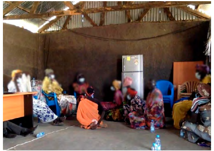
Survivors discuss impact of CRSV during Focus Group Discussions. June 2021.

To meet social, economic and psychosocial needs, survivors in different locations have expressed a desire for a women friendly space - “a centre for socialisation of victims” - where they could meet and share their stories, produce traditional handicrafts (including to generate income), be visited on a weekly basis by a counsellor or psychosocial expert, and raise awareness in the community.